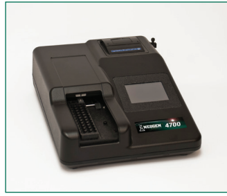
10. Read results in a microwell reader.