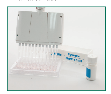
6. Transfer 100 µL conjugate from reagent boat to antibody wells using 12-channel pipettor, Incubate for 10 minutes. Mix for 20 seconds by sliding back and forth on a flat surface.