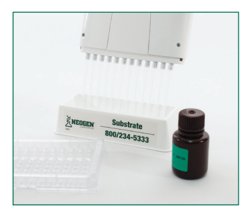
8. Transfer 100 µL substrate from reagent boat to antibody wells using 12-channel pipettor, Incubate for 10 minutes. Mix for 20 seconds by sliding back and forth on a flat surface.