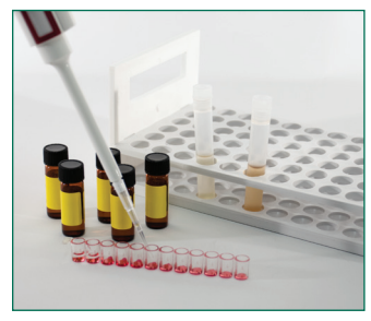
1. Add 150 µL controls and extracted samples to transfer wells.