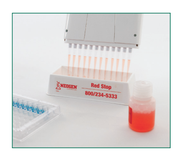
9. Transfer 100 µL Red Stop from reagent boat to antibody wells. Mix.