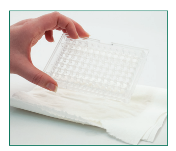
5. Tap out water on absorbent paper towel.